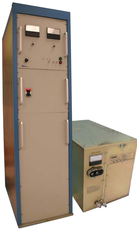
DTI's standard 200 kW Power Supply (left) and 300 kW Compact Power Supply (right) with 10 times greater power density.

DTI's 300 kW CPS was developed to power the US Navy Electromagnetic Railgun (EMRG) energy storage system under the Navy's Small Business Innovation Research Program (SBIR). Custom configurations are available for DC power or fast capacitor charging.