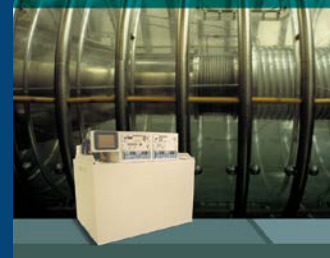
Advanced RF Systems